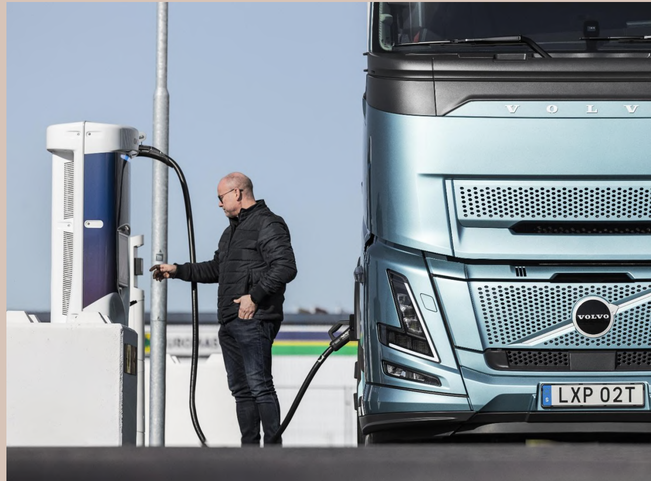
Volvo FH Aero