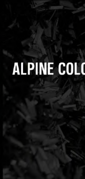
FIBERS CARBON IS A MUST BUT NOT ONLY [LINEN...]