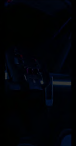
LIGHT AS SENSATION BOOSTER