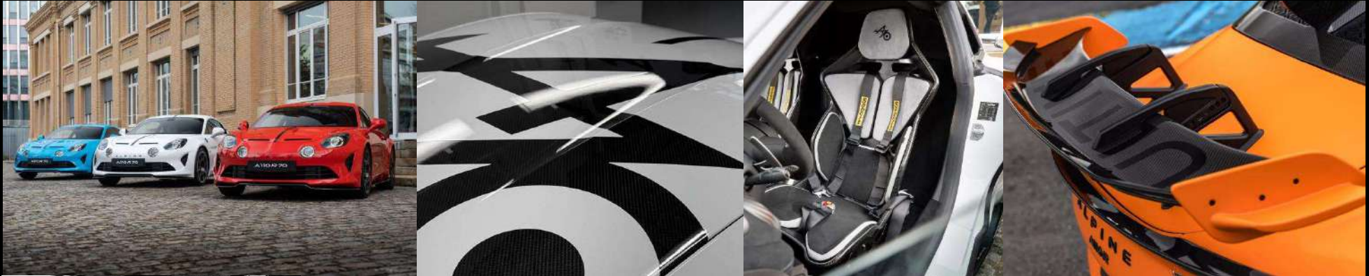
A110 R ULTIME