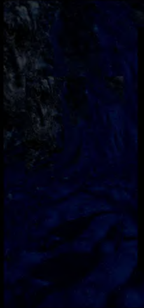
BODY COLOR 50 SHADES OF BLUE