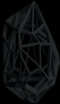
3D PRINT AS TECHNO | AS JEWELLRY