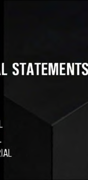
METAL AS STRUCTURAL