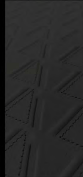
LEATHER AS RESPONSIBLE