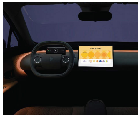
NIO FIREFLY RGB LEDS IN COCKPIT AND DOOR PANELS