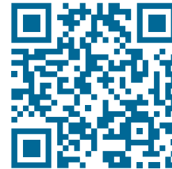
Lighting QR code

Slido is an interactive platform for events. It facilitates Q&A sessions, maximizing the user experience through livepolls and sharing. Simple, accessible and secure!