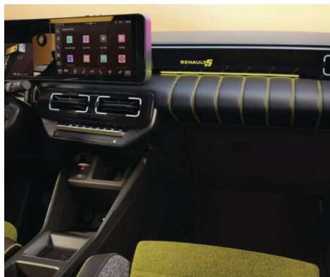
RENAULT 5 RGB LEDS ON PASSENGER SIDE DASH