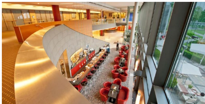
Adapted Exhibition room that can accommodate all exhibitors.

Since their inception, DVN Lidar Conferences have quickly become the must-go technical congress to see and hear all about the latest innovations amidst the galloping growth of the automotive lidar sector. The fifth DVN Lidar Conference is scheduled for November 30-December 1 st , 2022 in the Frankfurt am Main area.