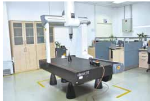
研发中心 R&D Centre