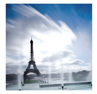
Paris May 2010, May 2011 and February 2014 220 attendees