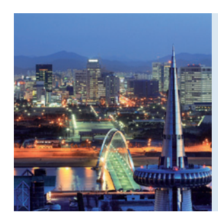
Seoul, Korea June 2014 200 attendees