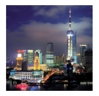
Shanghai, China April 2013 and 2015 320 attendees