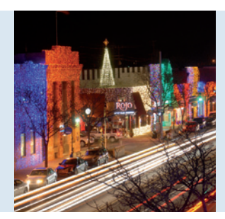
Rochester, Michigan January 2012, 2013, and 2015 250 attendees