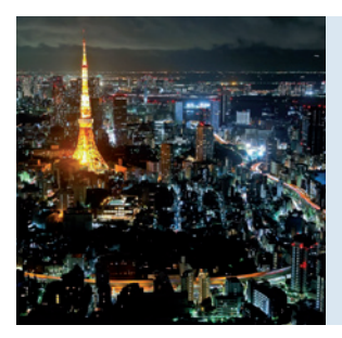
Tokyo, Japan June 2012 130 attendees