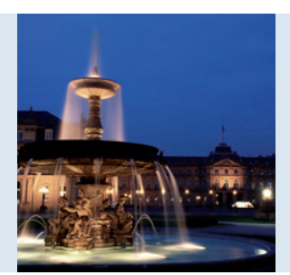
Stuttgart May 2009 20 attendees